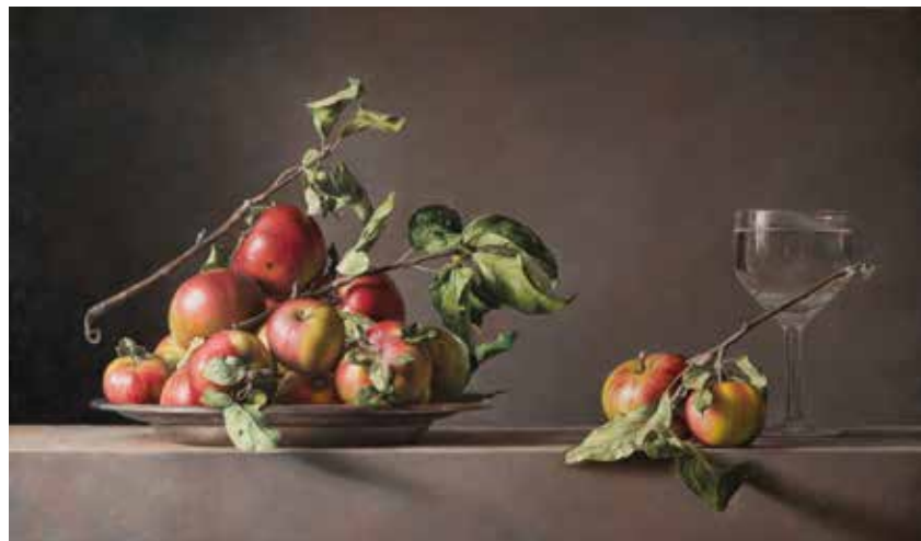
Piatto con Mele Selvatiche, 2016, olio su tavola, 55x95 cm

www.dhaudrecy-art-gallery.com · dhaudrecy@skynet.be