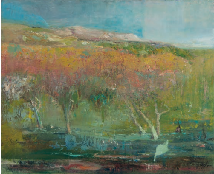
'Pommerarie', oil/canvas, 2015, 50x65 cm

Since 1996, shows regularly his work in Paris, France and abroad.