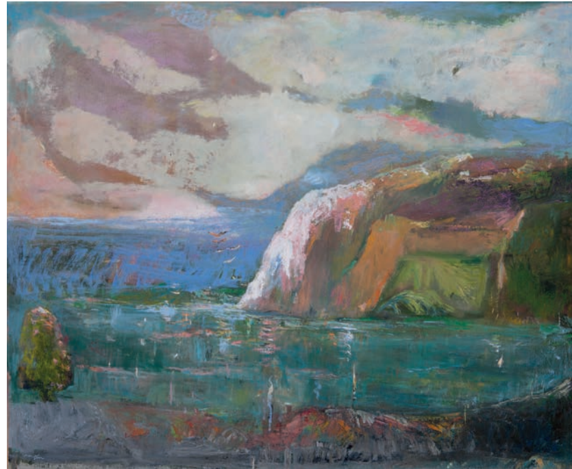
'Etrebleu', oil/canvas, 2015, 81x100 cm

www.dhaudrecy-art-gallery.com · dhaudrecy@skynet.be