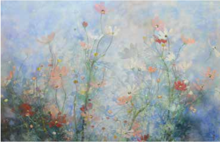
'Fête', Nihon-ga, 65,5x100 cm

Master of Kyoto City University of Arts Professor at Guimet Museum of Asian Arts, Paris Member of the Foundation Taylor for Arts.