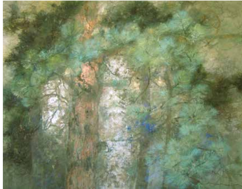
'Couleurs d'été', Nihon-ga, 94x122 cm

www.dhaudrecy-art-gallery.com · dhaudrecy@skynet.be